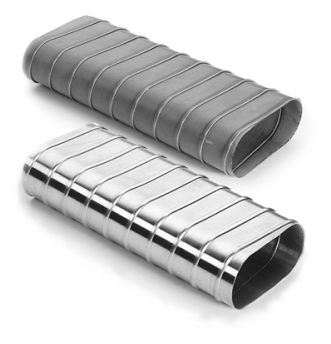
Figure 1: Flat ducts suitable for integration in the façade