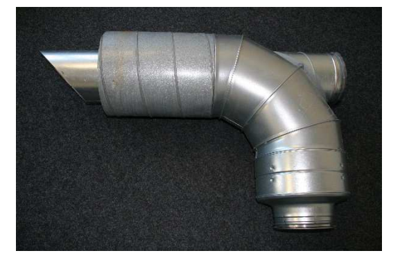
Figure 3: Combined Outdoor air and Exhaust air duct [PHI]

A possibility would be a duct-in-duct solution of air intake and exhaust.